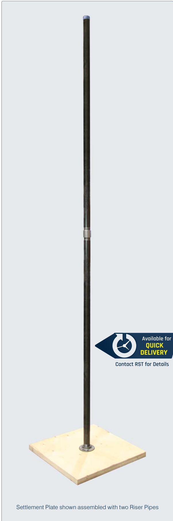
Settlement Plate shown assembled with two Riser Pipes

Available for QUICK DELIVERY Contact RST for Details