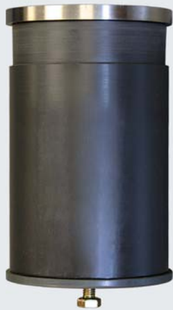
A Vibrating Wire Joint Meter shown with its unscrewed socket (above).